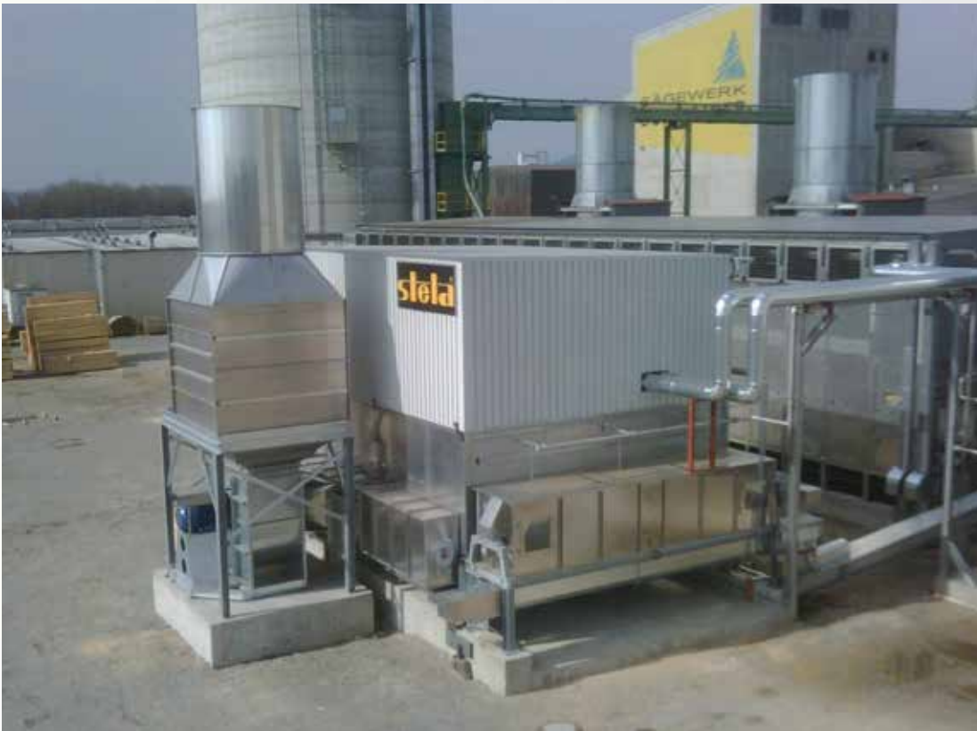
Project: Sägewerk Schwaiger, Germany Type: BT 1/6200-9 Year: 2009 Product: Sawdust Dryer output capacity: 2.8 t/h from 50% - 10% MC