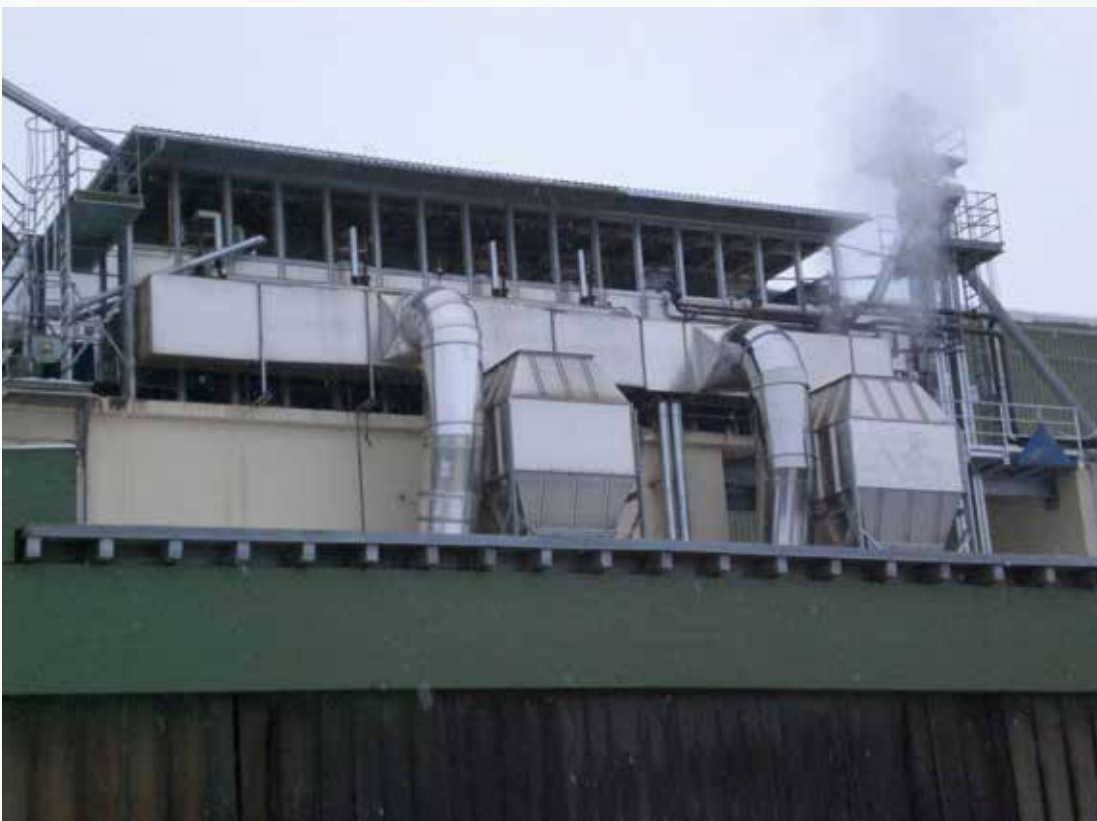
Project: Bayerwald Pellet Germany Type: Extention from BT 1/2700-10 to BT 1/2700-16 Year: 2009 Product: Sawdust Dryer output capacity: 2.1 t/h from 50% - 10% MC