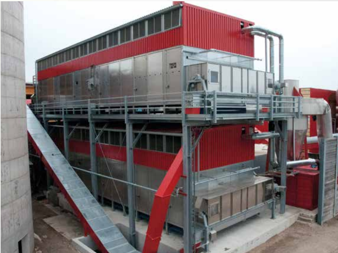
Project: German Pellets Germany Type: 2x BT 1/6200-22.5 Year: 2010 Product: Sawdust Dryer output capacity: 2x 6.5 t/h from 50% - 10% MC