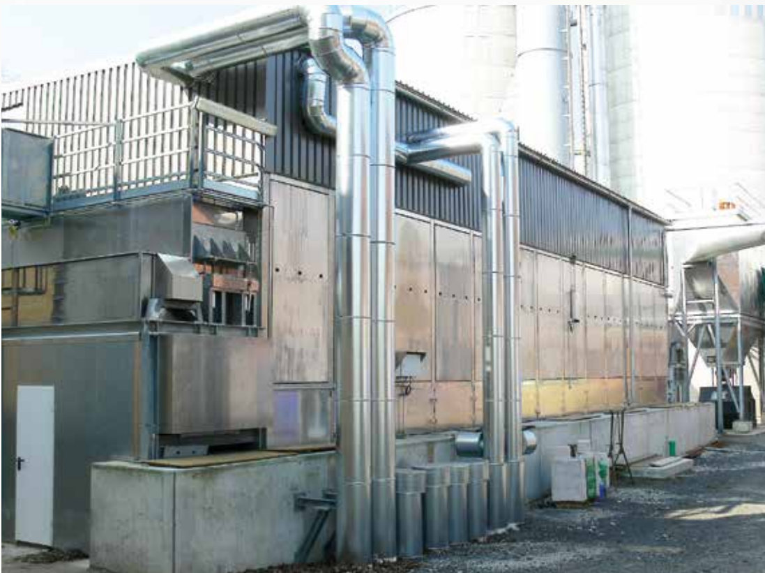
Project: EVO Energie- versorgung, Germany Type: BT 1/6200-19.5 Year: 2010 Product: Sawdust Dryer output capacity: 6.0 t/h from 50% - 9% MC